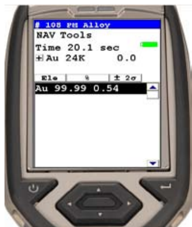
Figure 3. Based on factory calibration, results of analysis of unknown samples are displayed