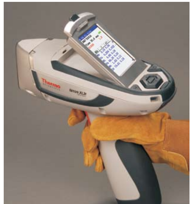
The Thermo Scientific NITON XL3 Series—Simply Superior XRF.

Anyone familiar with Microsoft Windows™ will have little difficulty navigating through these software modules.