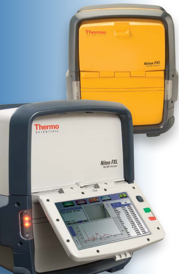
Niton FXL Mining analyzer (top) Niton FXL Consumer Goods/RoHS analyzer