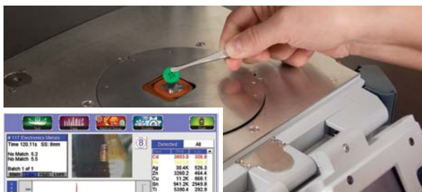
Small-spot feature: Isolate test areas as small as 1 mm and conveniently store sample measurements for later reference.